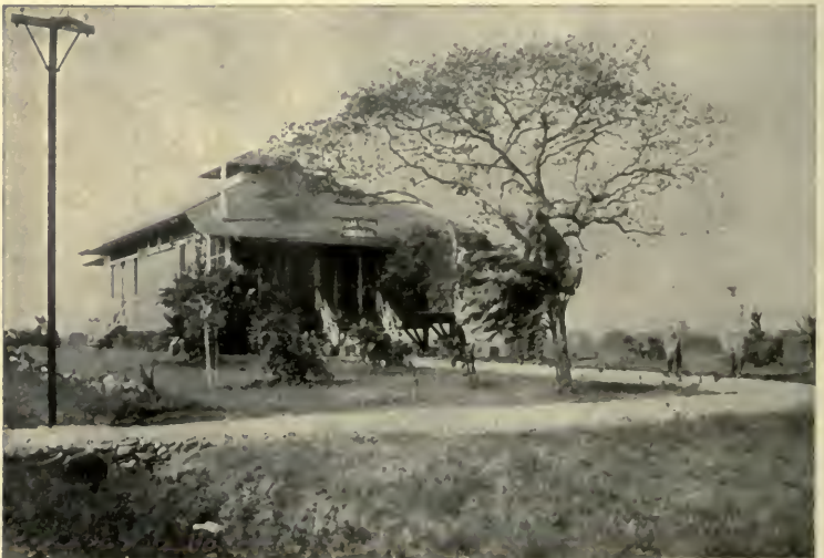
Corozal Police Station