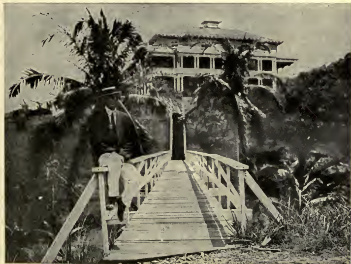
The "Thousand Stairs"