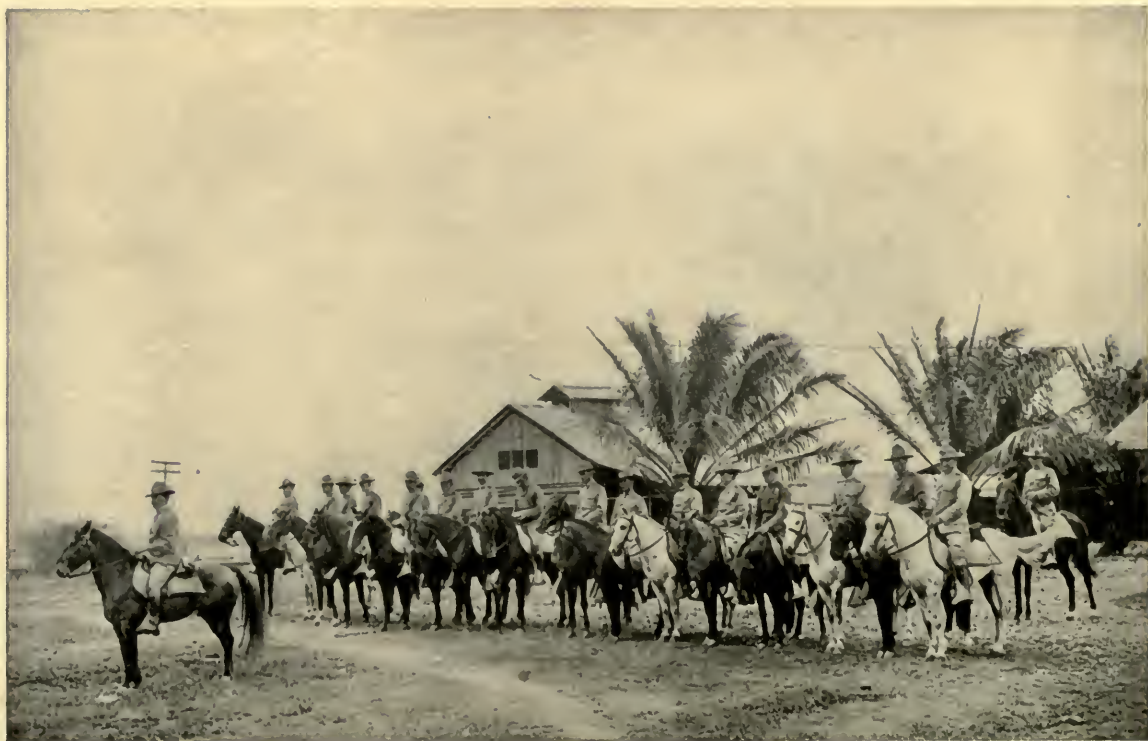
The Zone Police mounted squad on "Aviation Day"