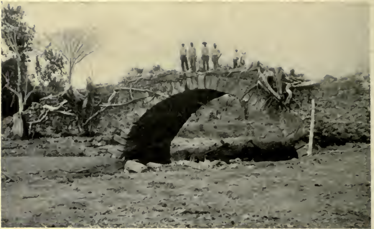
Among the ruins of Old Panama