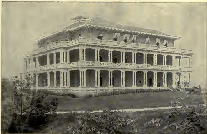
The Administration Building at Ancon